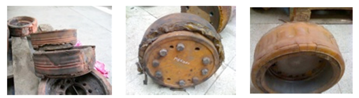
Fig.5. Drive wheel damaged during use

The first far left photo shows ripped out parts of the elastomeric layer, with slots grooved by the time of exploitation, which, in theory, should be working against a flat surface of the rail.