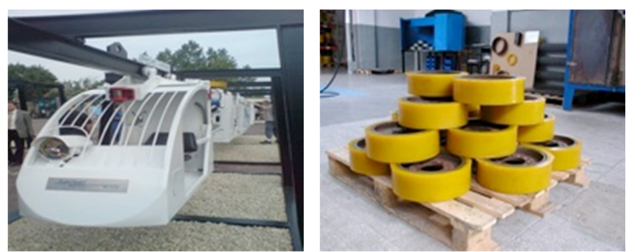
Fig.1. Suspension railway with tread wheels working in the state of extreme load

The analysis of the operational reliability of the suspension railway in mining was researched at the Mining Mechanization Institute of the Silesian University of Technology by doctor Tadeusz Giza [1]. According to tests he ran on the railway motors (main drive, motor drive mechanism, capstan, and electrical) most often it was the drive mechanism that was damaged. The drive mechanism failure constituted around 47% of all failures, where the breakdown of wheels happened in 17,86% cases and the time spent fixing them constituted 24,32% of all repairs. This shows the scale and significance of the matter.