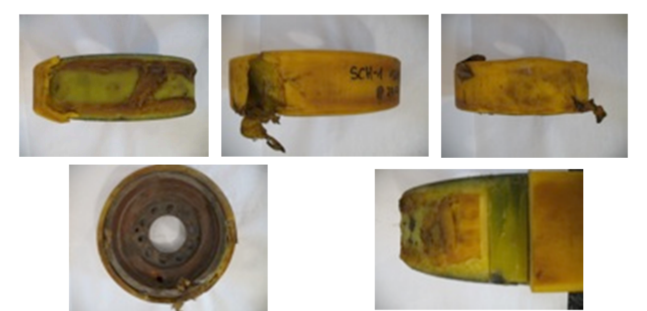
Fig.4. Wheels under refund claims

Pictures of the wheels under refund claims shown in Fig. 4.