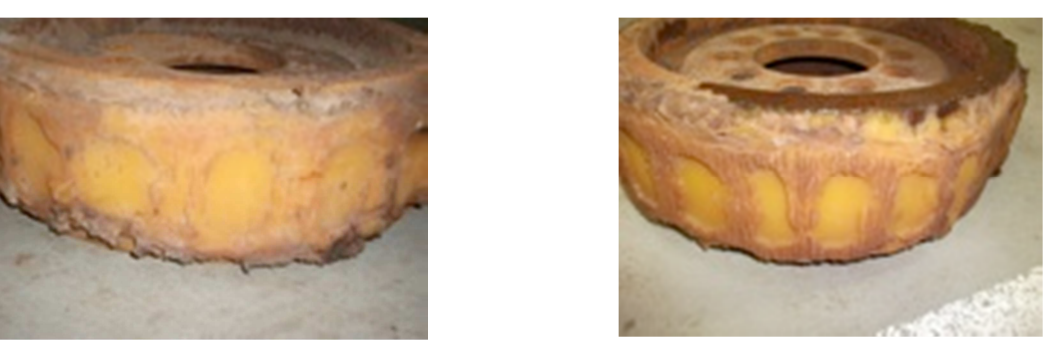
Fig.3. Images of the correctly produced and used drive wheels

The characteristics of the properly produced and used treads are: